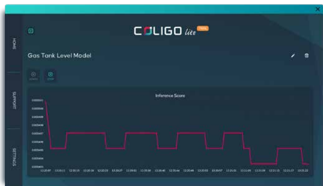
Fig: Learning in progress for the acquired data until the inference score converges to zero