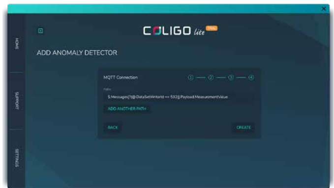
Fig: Adding the JSON path to the variable to be collected