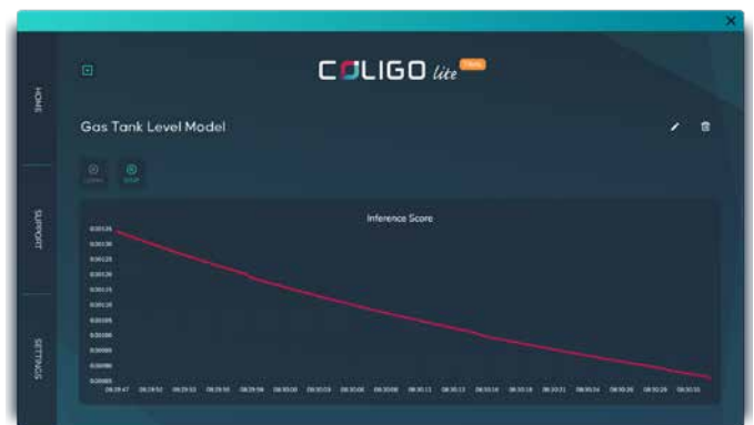
Fig: Inference mode