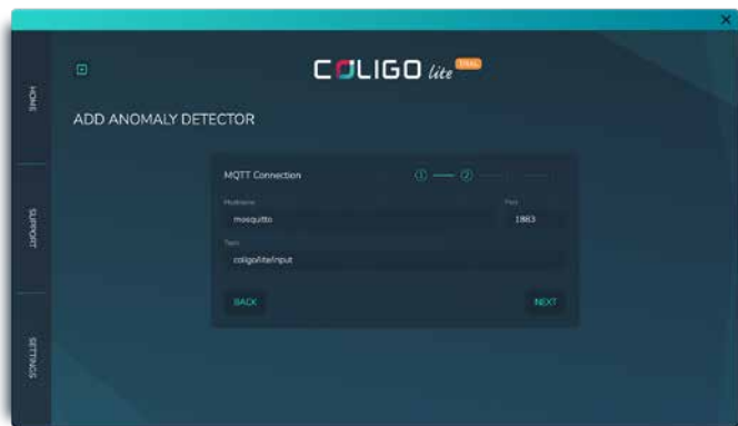
Fig: Secure connection to the broker